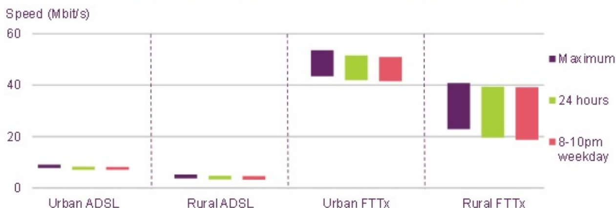
Figure 1.6 Average actual urban and rural ADSL and FTTx download speeds

Ofcom's annual Communications Market Report finds broadband speeds are up by 18%, but separate monitoring shows ... The average full-fibre penetration rate according to the FTTH Council's European ranking is 36.4%. This resulted in the average residential download speed increasing by 18% to 54.2 Mbps, more than double the figure claimed by cable.co.uk earlier this week.. UK households are benefiting from faster, more reliable internet as new Ofcom research reveals average broadband speeds have ... people receive has passed the 50 Mbit/s mark – rising by 18% in the last year to 54.2 Mbit/s. Glary Utilities Pro 5.125.0.150 Crack